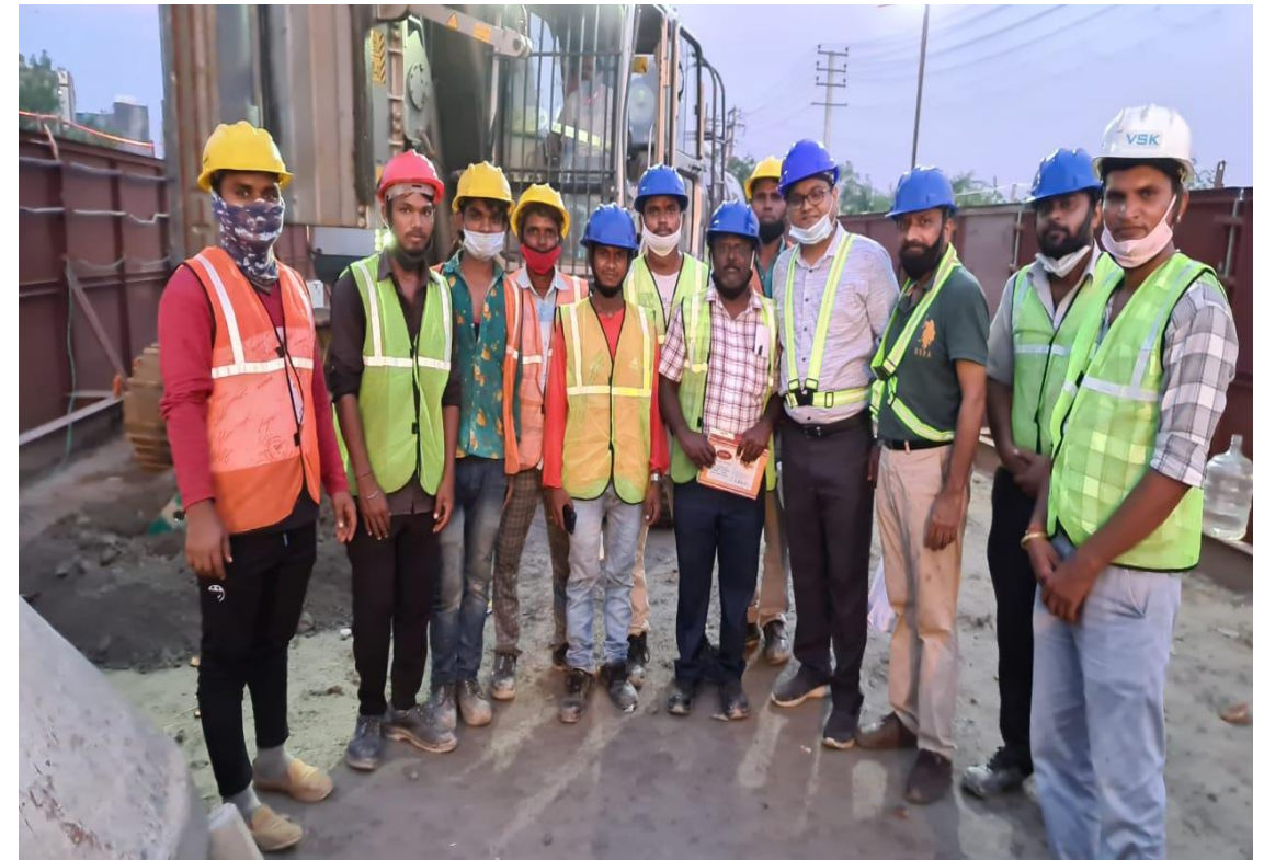
Our Site Team