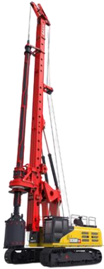
Rig Machine- Sany 205